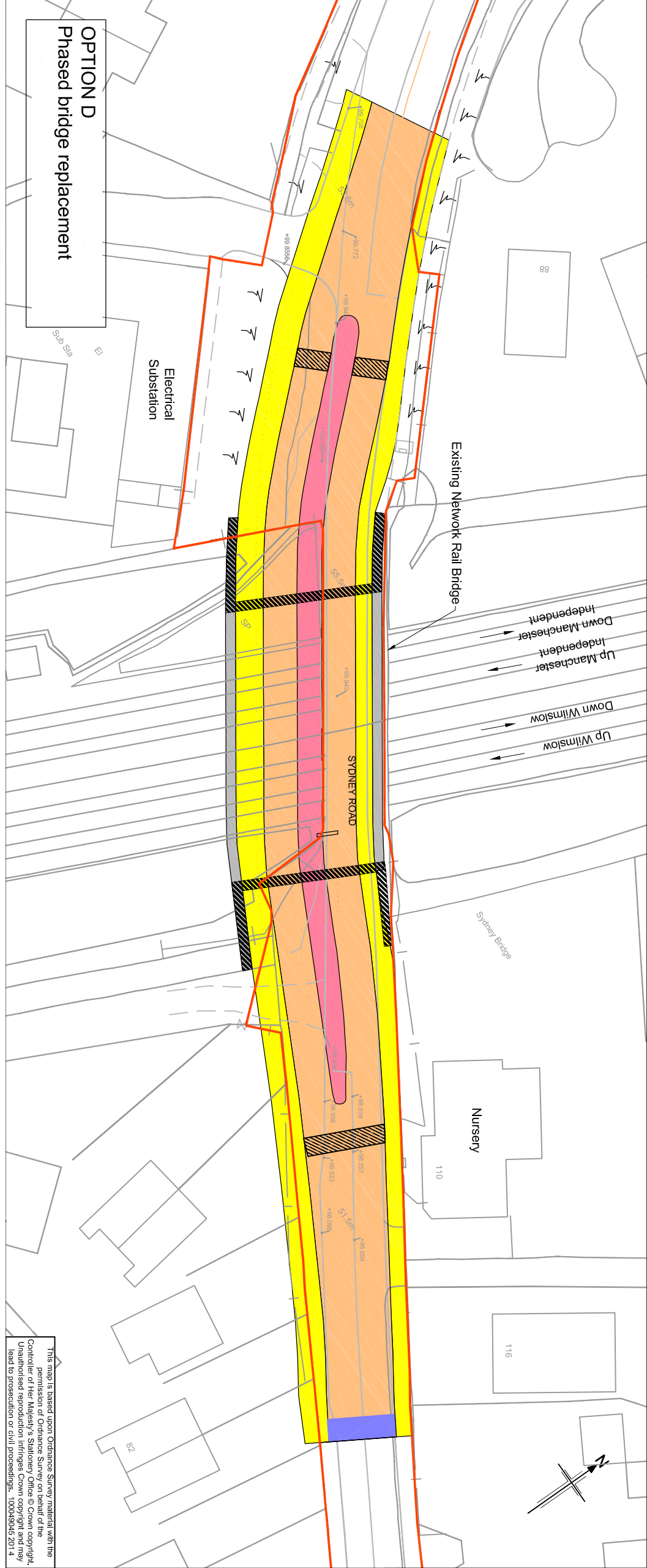
OPTION D Phased bridge replacement

NOTES: 1. Layouts are diagrammatic for initial assessment of options only.